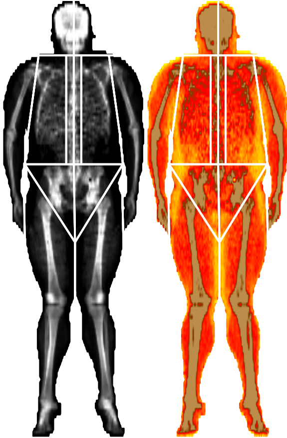
Total Body Bone Density

Patient: ##### Patient ID: ##### Birth Date: ##### Height / Weight: ##### Measured: ##### (14.10) Sex / Ethnic: ##### Analyzed: ##### (14.10)